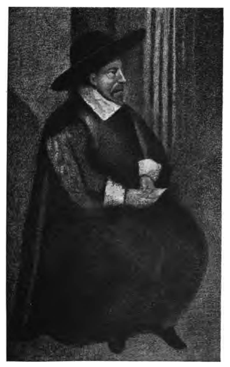
DETAIL FROM THE PAINTING OF AN AUDIENCE WITH THE DOGE, AT HAMPTON COURT (PORTRAIT OF WOTTON)